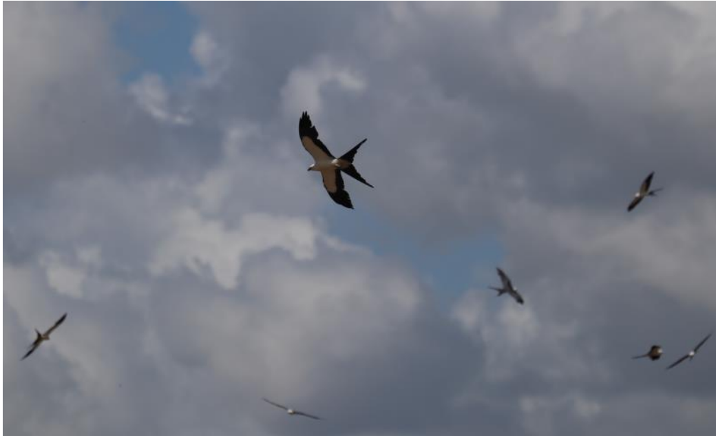
Swallow-tailed Kites.

the point. Common Terns are rare inland, and were last seen here September 11 th , 2018 when Hurricane Michael blew a few our way.