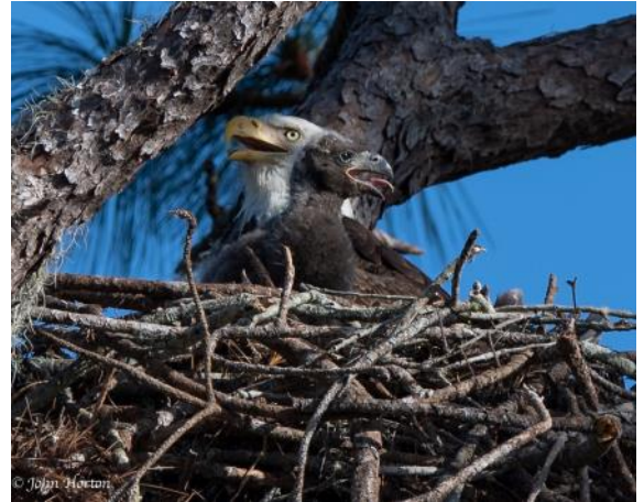
Adult Bald Eagle and eaglet in nest.