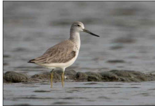
Nordmann's Greenshank.

This will be an online Zoom meeting. Watch for time and date to be announced on the Alachua Audubon Facebook page and the Alachua Audubon website,alachuaudubon.org .