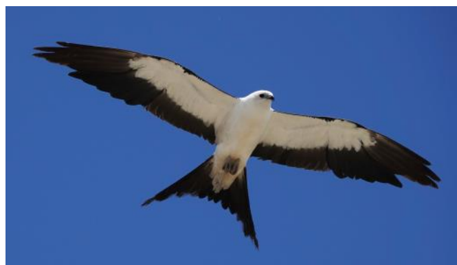
Swallow-tailed Kite.

those who dutifully made their way to Palm Point Park at Newnans Lake that morning “just to check” were rewarded with a spectacular flock of twenty-five Common Terns sailing past