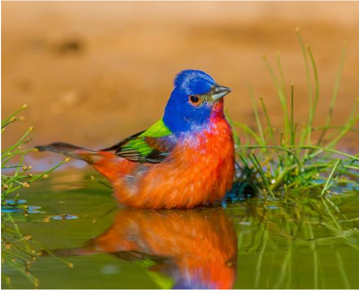
Painted Bunting.

Join Audubon Florida virtually for Florida's premier conservation event, when grassroots leaders from around the state connect with Audubon's professional staff and partners to grow their knowledge and skills to protect Florida's precious natural resources.