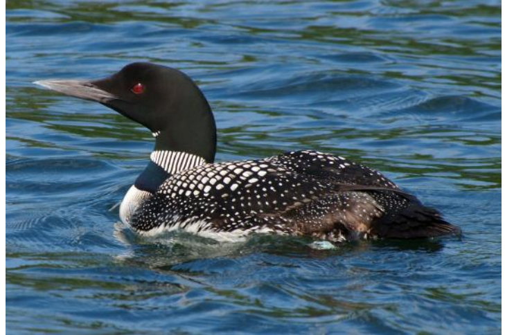
The Common Loon, Gavia immer.

The extra eyes have also enabled Kratter to get a more accurate sense of loon numbers, he says. On March 31, the birders tallied 325 loons, a new single-day record, and by the end of the migration, they had counted 2,190, smashing the previous seasonal best of 895. Kratter says the spike doesn’t necessarily mean loon populations are booming. Still, there are more loons than he thought there were. “The high number of loons indicates that this migratory pathway is even more important than I had imagined.